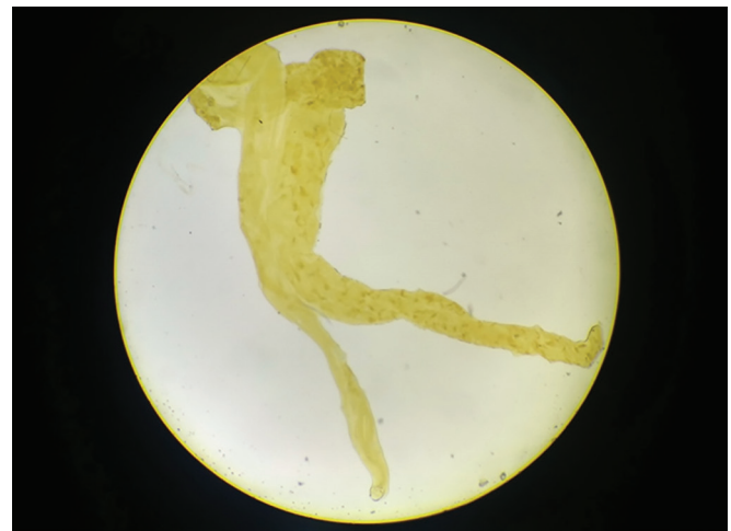
Fig. 2: Male and female hookworms—under scanner lens (4×)

Hookworm infection is worldwide in distribution. The two different hookworms are A. duodenale and N. americanus . The habitat of adult hookworms is the small intestine of humans. While 1,200 million people are infected by this nematode globally, about 20 million Indian population are affected. An adult female worm lays 25,000 to 35,000 eggs per day. Although most of the cases are asymptomatic,